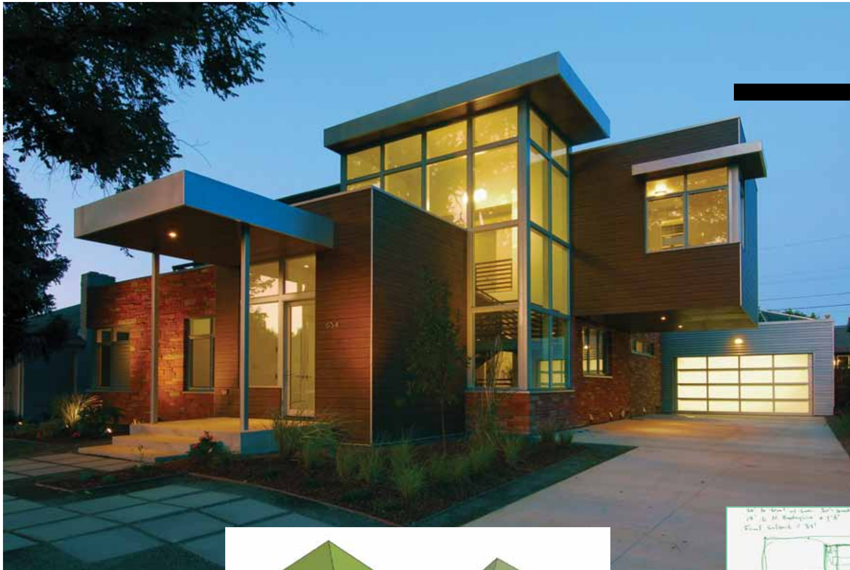
ABOVE: An exterior view of one of Elemental Living's residences on Ivanhoe Street in Denver. The stone on the exterior was reclaimed from a building on the University of Colorado's Boulder campus.