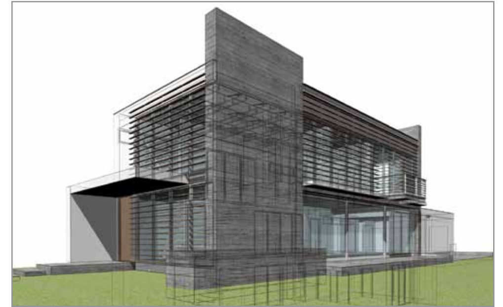
ABOVE: Computer renderings of future Elemental Living homes.